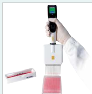
Repeat Dispense Dispensing of multiple aliquots of the same volume

The popular VIAFLO electronic pipettes provide advanced pipetting functions at the touch of a button. This lightweight, easy to use option offers 10 preset pipetting programs to perform a range of functions, helping to really accelerate and simplify set-up of your application.