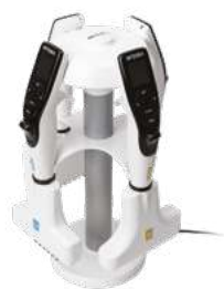
Carousel charging stand (4215)