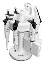
Pipette rotary stand (3213)

Two linear stands (#3214 for Short, #3215 for Standard) accommodate all types of INTEGRA pipettes. They can be easily converted into charging stands by the addition of up to 4 charging stations (#3217) and a mains adapter (#3216). Alternatively, a charging communication station (#3218) can be added to enable communication between the pipette and a PC with VIALINK. The pipette rotary stand (#3213) and wall mount for handheld pipettes (#3205) may be used for storage, or with a mains adapter (#4200) for space-saving charging.