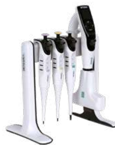
Short linear stand (3214)