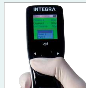
Custom programs Full flexibility to write and run your own protocols

Additional preset programs include standard Pipet Mode, Sample Dilute, Manual Pipet, Reverse Pipet, Variable Dispense, Multi aspiration Mode, Sample Dilute/Mix