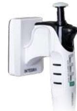
Wall mount (3205)