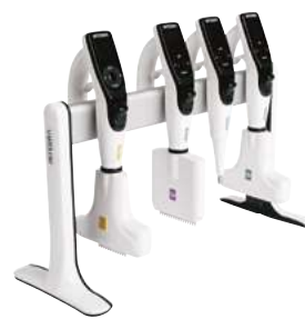
Linear stand (3215)

Two linear stands (#3214 for Short, #3215 for Standard) accommodate all types of INTEGRA pipettes. They can be easily converted into charging stands by the addition of up to 4 charging stations (#3217) and a mains adapter (#3216). Alternatively, a charging communication station (#3218) can be added to enable communication between the pipette and a PC with VIALINK. The pipette rotary stand (#3213) and wall mount for handheld pipettes (#3205) may be used for storage, or with a mains adapter (#4200) for space-saving charging.