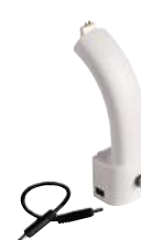
Charging station (3217) Charging/communication station (3218) Mains adapter (3216)