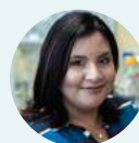
Edisa Albino CDI Labs in Puerto Rico

"The VIAFLO is so ergonomic and comfortable for our users that fatigue is simply no longer an issue. It takes seconds to fill 96 well assay plates or 24 well cell culture plates. The workflows are much faster, the throughput significantly increases and the results are accurate."