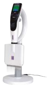
Single pipette charging stand (4210) Communication stand (4211)