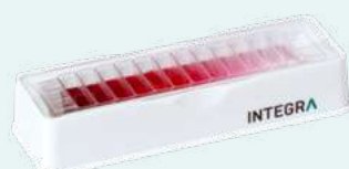
12 well reagent reservoir