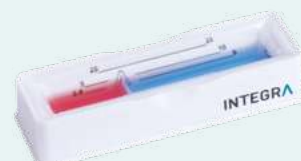
Divided reagent reservoir, for exceptionally low dead volume