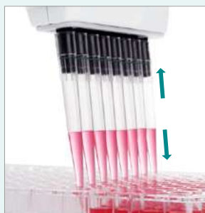
Pipet/Mix Transfer of a defined volume followed by a defined number of automatic mixing cycles