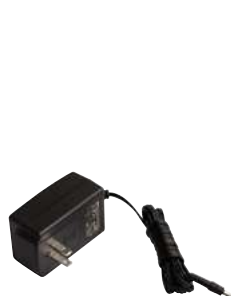
Mains adapter (4200)

Pipettes can be charged directly with the pipette mains adapter (#4200). The single pipette charging stand (#4210) and the carousel charging stand (#4215) offer space saving alternatives. The charging/communication stand (#4211) also enables communication between the pipette and a PC with INTEGRA's VIALINK Pipette Management Software.